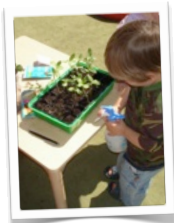
Learning about the world...