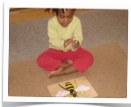
Working for myself...