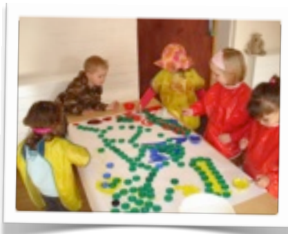
Creating something together...