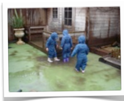
Enjoying all weathers...