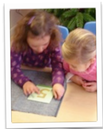
Teaching my friends....