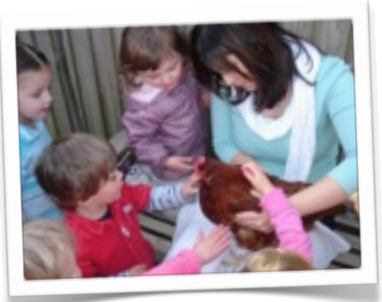
Meeting something new...