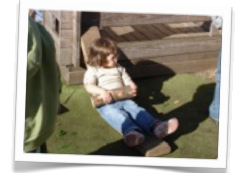
Taking time to relax....